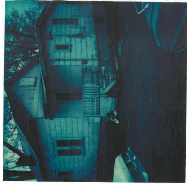
327 1/2 E. FRONT