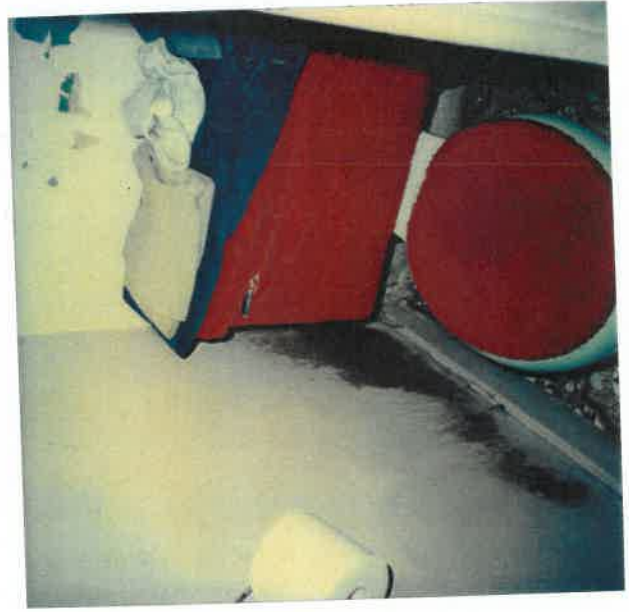
327 1/2 E. FRONT