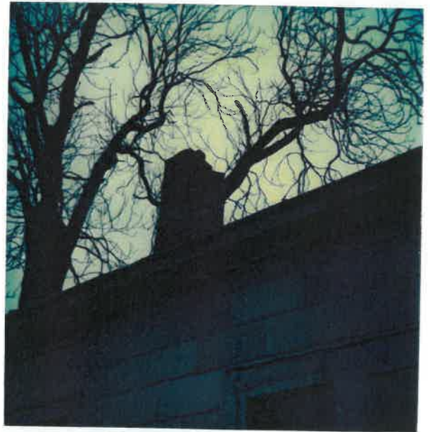
327 1/2 E. FRONT