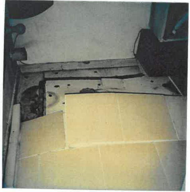
327 1/2 E. FRONT