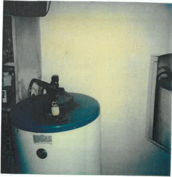
327 1/2 E. FRONT